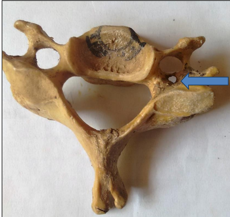
Photograph 1: Cervical vertebra showing unilateral double foramen transversarium